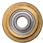
21178 (Sold Separately)

LIGHTWEIGHT Only 5-1/2" wide and lighter than any other cutters on the market for easy transport to the job site