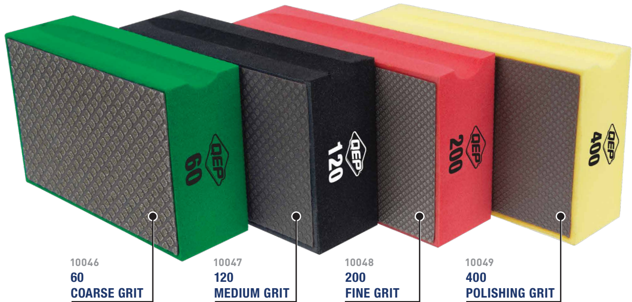
10046 60 COARSE GRIT