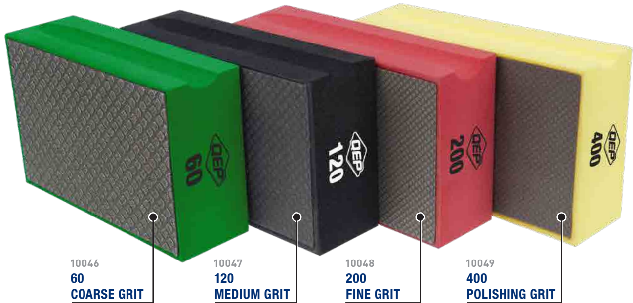
10046 60 COARSE GRIT