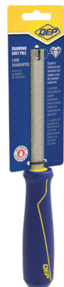
Blister card packaging

Flat side and round side for smoothing straight or curved edges