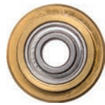
21178 (Sold Separately)