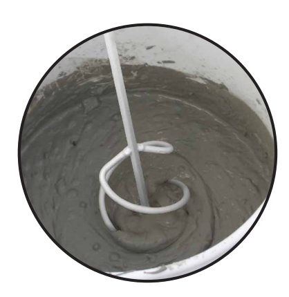
FOR MIXING UP TO 5 LBS. OF GROUTS, THINSET AND OTHER SETTING MATERIALS

· Mixes mortar and thin-set with a power drill