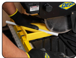
The "V" bevel is for pencil and jolly trim