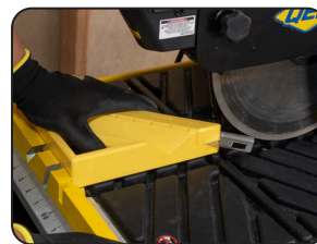
Side slot for perfect 45° angle cuts on tile trim profiles